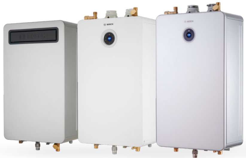
T9800 SE Outdoor

Designed for outdoor conditions No vent pipes necessary Included LP conversion kit